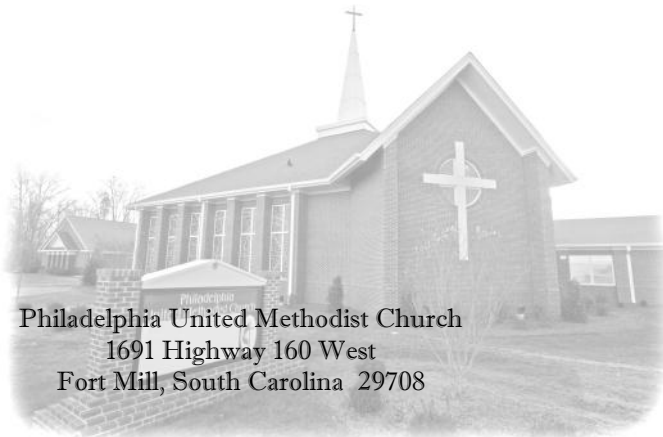
Philadelphia United Methodist Church 1691 Highway 160 West Fort Mill, South Carolina 29708

Non-Profit Organization U.S. Postal Permit 12 Fort Mill, SC 29715